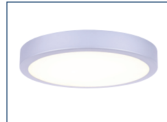
LK-CPPG - Grey