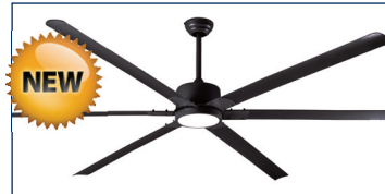
CP96-LEDBK Complete with light kit