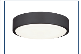
LK-CPBK - Matte Black