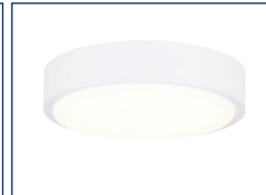
LK-CPWH - White